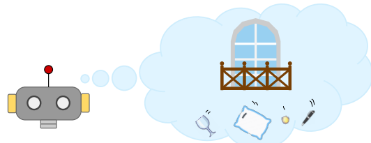
A person drops a glass , a pillow , a coin , and a pen from a balcony. The [MASK] is most likely to break. A) glass B) pillow C) coin D) pen

In the context of natural language processing (NLP), Bender and Koller (2020) provides a working definition of “understanding” as the ability to recover the communicative intent from an utterance. To achieve this, one must be able to query a set of concepts that is aligned with the speaker’s own understanding. An example of such alignment is our interaction with the physical world. This experience, shared by all humans, provides a common set of concepts to rely on in communication. For example, the reader can map the phrase I dropped my pint glass to a set of relevant experiences and generate a mental depiction of the scene. Further,